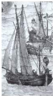
Willem van de Velde: The Batavia of Scheepvanger (The Mermaid), 11 July 1643 . Pen painting on canvas, 7 1/2 x 20 1/2 in. Signed and dated 'W. de Velde 1643' in yellow van oyle. Amsterdam, Rijksmuseum. Detail in the foreground: Willem van de Velde at work on board his galleon.

Van de Velde probably produced his first pen paintings around 1645, and they were so skilful that it soon became a very popular art form. His patrons included the Tromp family, who commissioned a series