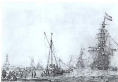
Willem van de Velde the Elder. The Merchant Fleet Sailing for the Sound on 9 June 1645. Engraved by 47 Men-of-War Under the Command of Willem de With. Pen painting on paper. 71 x 105.5 cm. Leiden, Stedelijk Museum De Lakenhal.

Van de Velde was evidently present when the fleet sailed, for he made a number of drawings of the event which he later used for several pen paintings, specimens of which are in the Lakenhal in Leiden and the National Maritime Museum in Greenwich.